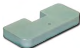
30 KG BALLAST