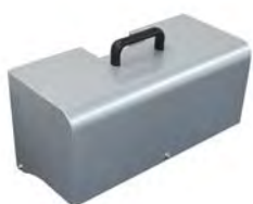
BATTERY PACK 37/45A AGM