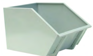
PAINTED SKIP 500 L