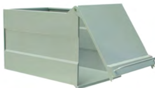
PLATFORM 700 L