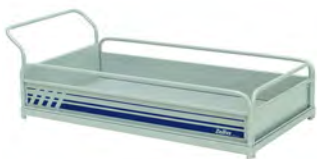
PLATFORM 695X1250XH230 MM