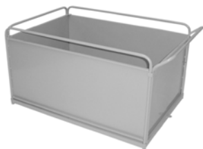
PLATFORM 800X1250XH630 MM