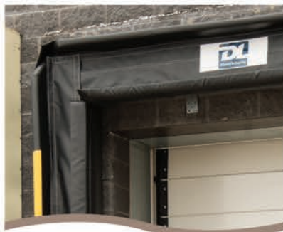
U-SEAL NON-COMPRESSION DOCK SEAL PATENT PENDING