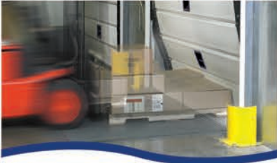
M&V™ ENERGY-ABSORBING DOCK DOOR