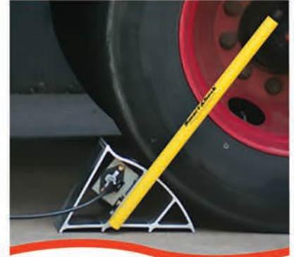
VECTOR CHOCK™ THE FUTURE OF VEHICLE RESTRAINTS