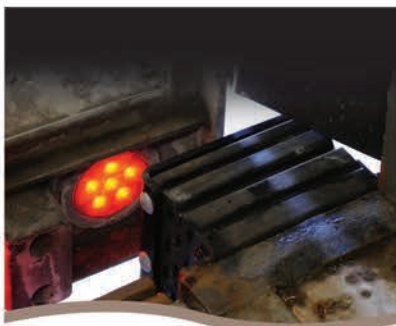
zero IMPACT DOCK BUMPER PATENT PENDING