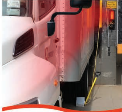
SafetySignal™ PATENT # 6,869,654