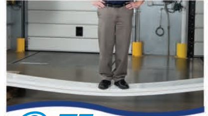
Q&V™ Flexible Sectional Dock Door