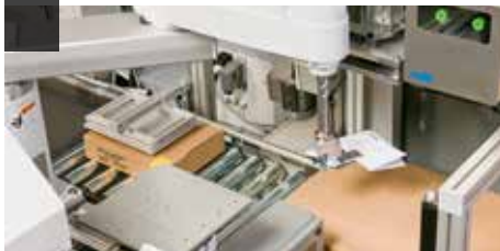
Print & Pouch