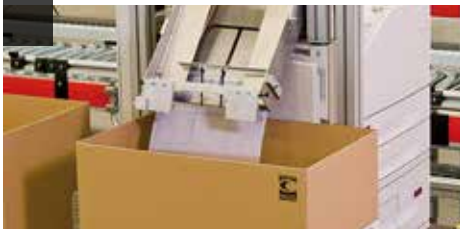
Print & Place