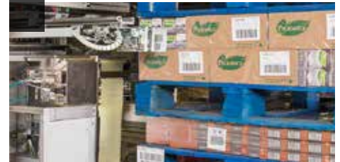
Print & Apply