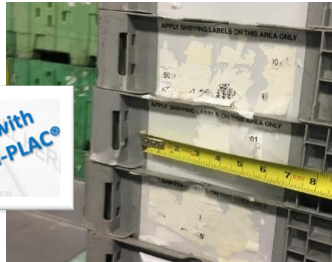
Figure 1- Silicone placard is no longer functioning as a label holder. The release surface has been damaged! SOLUTION→INTELLI-PLAC®